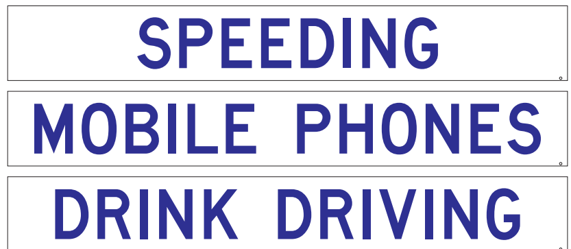
Example message boards