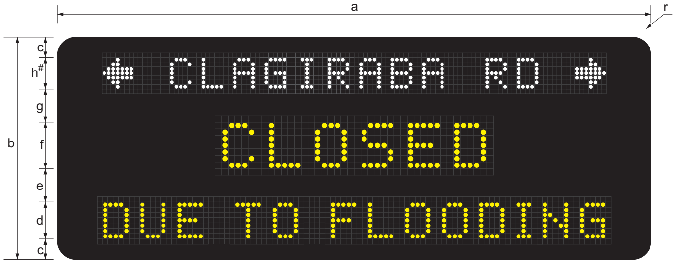
OPTION 1 - (Both directions)