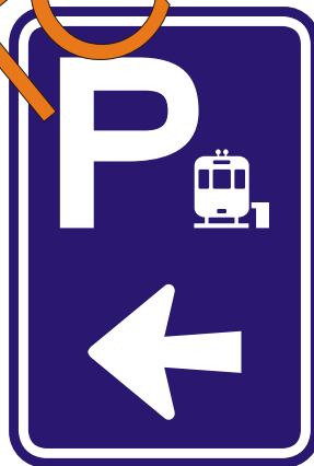
L or R