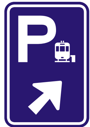
45° (L or R)