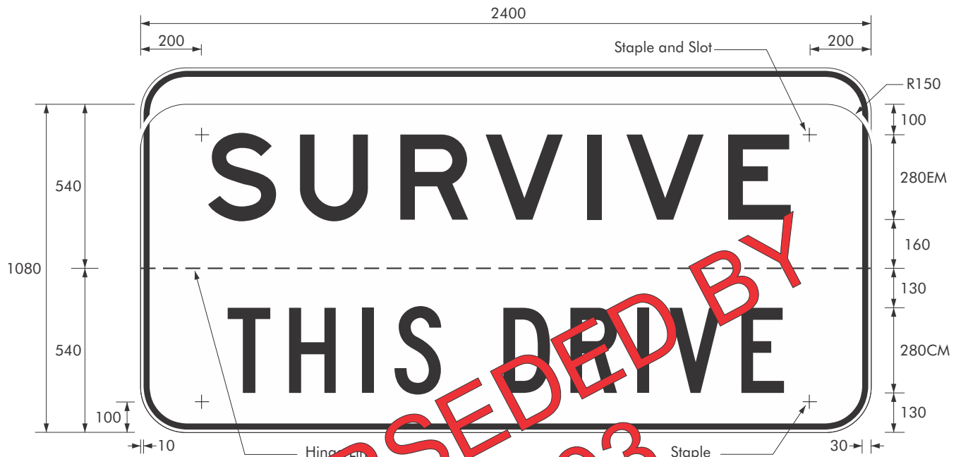
HINGED FLAP IN RAISED POSITION