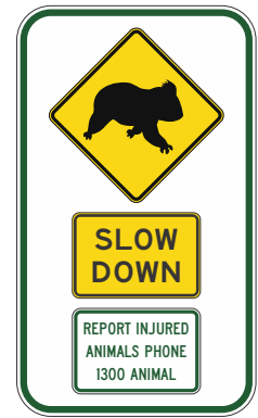
Example (See notes 2 & 3)